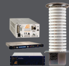
HiTek Power ™