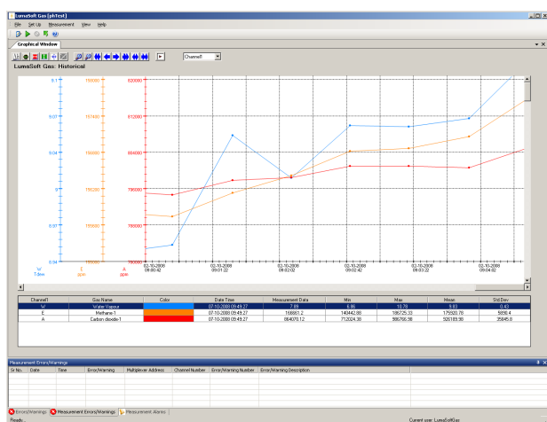
Fig. 1: The graphical window shows up to seven graphs. The user selects the data plotted, the scaling, and the style and color of the lines and background to build the graphical window.

In the 7820/7880 software, the graphs can be configured to display only the desired gases, defined concentration ranges, and results from statistical analyses. Also, when using the 7880 software, all measurement data is stored in user-defined SQL Server 2014 database.