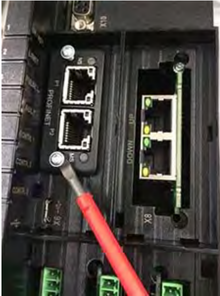
Figure 6. Anybus module removal

If an Anybus module must be removed from the unit, loosen the TORX T8 mounting screws 3 turns, and pry out the module with a small flat-bladed screwdriver, as shown in the following figure.