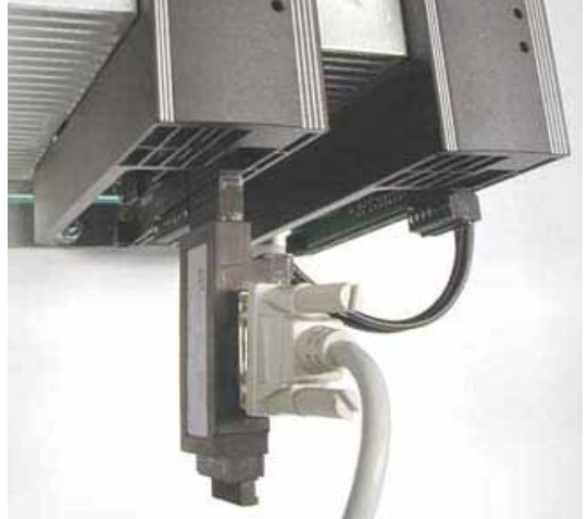
FIG. 3 THYRO-A 2A