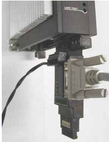
FIG. 1 THYRO-S

The connection of the interface at Thyro-S corresponds to fig. 1. Then the free upper 7-pin row is intended for the plug that was before on the connection present (set point wiring). The plug is to be put directly below the Thyro-S from left side on to the interface.