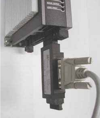
FIG. 2 THYRO-A 1A