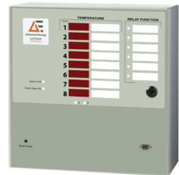
Advanced Energy's Luxtron ThermAsset2