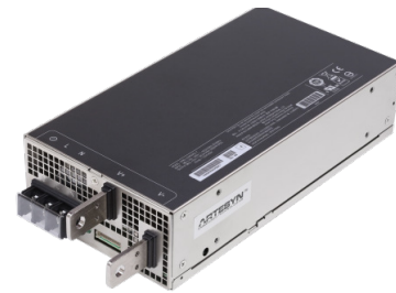
Advanced Energy's Artesyn LCM Series