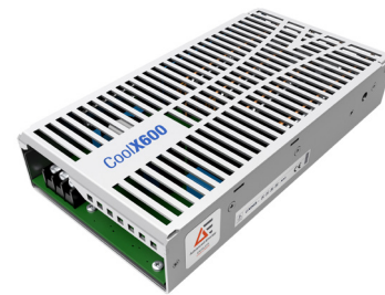
Advanced Energy's CoolIX Series